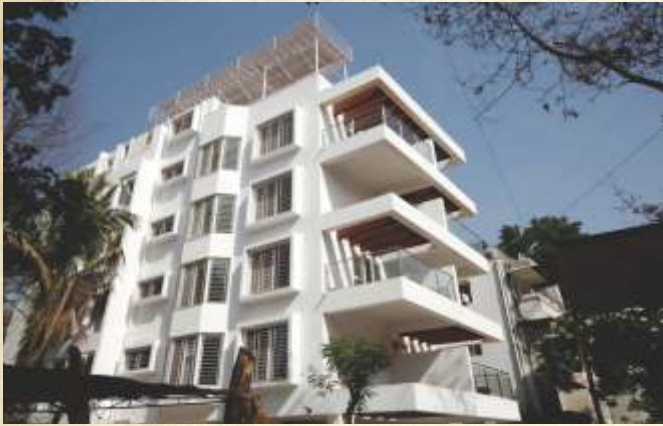
Riya Paud Road, Pune