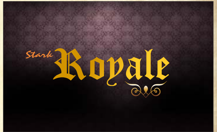
Stark Royale Kothrud, Pune

We are also coming soon with hi-end projects at Baner, Balewadi, Wakad area.