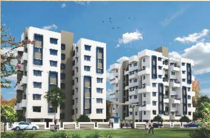
Stark Aura Ambegaon, Pune