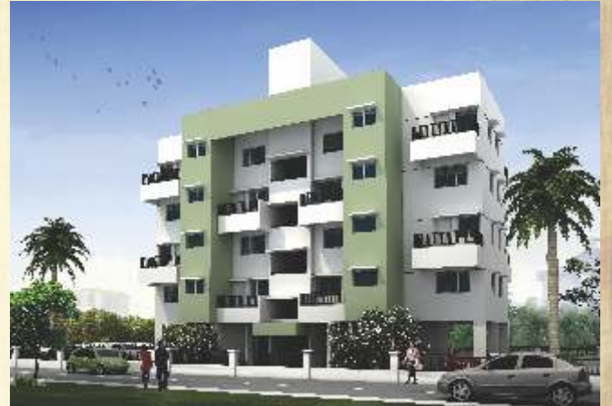
Nisarg Residency Katraj Road, Pune